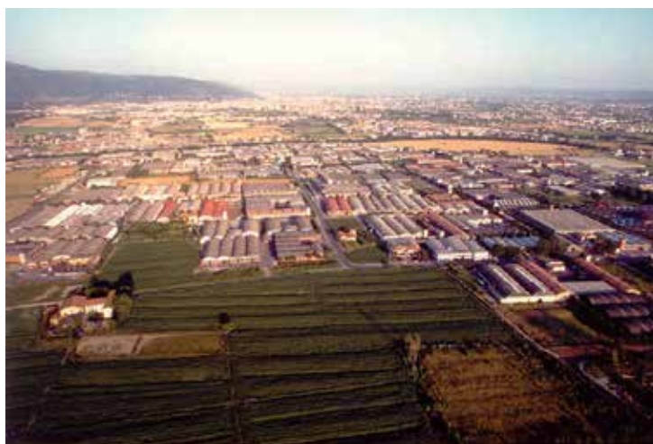
View of an industrial area

Hence, a sort of “parallel district” developed that established itself in the facilities vacated by the textile firms that were leaving the business (ideally: mixité , small sheds, etc.) and that found legal grounds for their activities in the laws on immigration. However, a good portion of the Chinese presence could and can still be considered “irregular”, also because of the insufficient attention (before) and the scarce controls (after) provided by the appointed authorities.