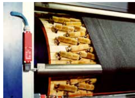
Teasing with natural processing for noble fibres

The second half of the 1980s proved a difficult period. The district was forced to dispose of the excess of investments in carded wool made during the previous decades, since the market for those products was rapidly dwindling. During that period, 28% of the workers lost their jobs and 37% of the firms went out of business. The crisis would be absorbed by the local system in the 1990s, thanks to a strong tertiary sector