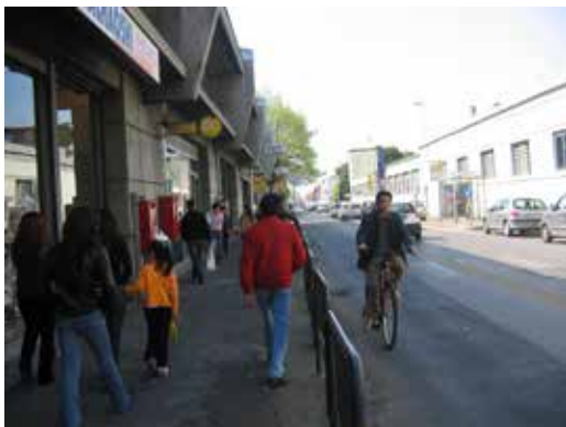
the chineses in Prato

During the 1980s, the progressive drying up of southern immigration and the further reduced coverage of the lower segments of the labour market by the local population cleared the way for non-EU immigration, albeit in a context of a slower growing local economy and a diminishing number of manufacturing jobs. The new migratory influx concerned a large number of nationalities; these are currently more than 100, but in the 1990s the prevailing nationality was Chinese.