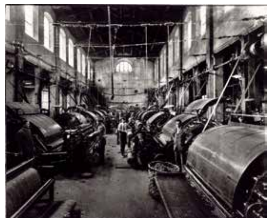
Inside of an ancient factory