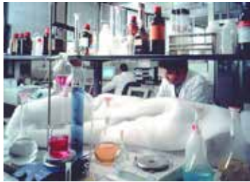
Istituto Buzzi' laboratory

The situation is truly unequalled both in terms of quality and quantity, and has the potential to produce disruptive effects even in a town like Prato, that is historically and socially accustomed to immigration and integration.