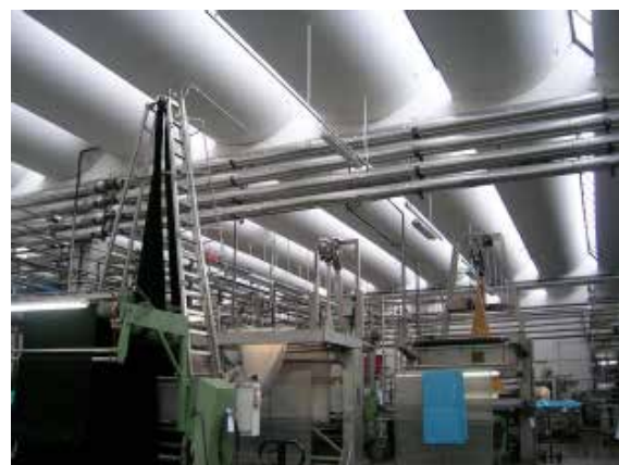
Inside of a finishing mill

These areas of improvement are closely tied to the problem of increasing the organizational capacity (which is linked to but does not coincide with dimensional growth) which, in this sense, can be considered a crucial node.