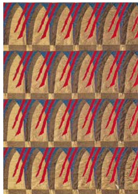
Details of the fabric given by Prato for Pope Giovanni Paolo II cope during the Jubilee of 2000